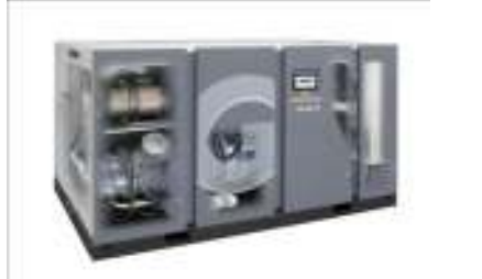
AIR- COMPRESSOR LOW-PRESSURE