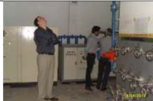
UK GAS WITH LINDE