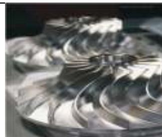
TURBINE VANES- LONG LIFE-FASTEST COOLING