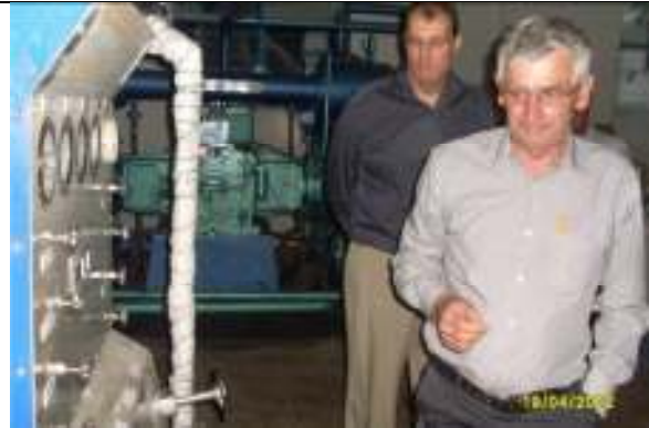
UK GAS WITH LINDE