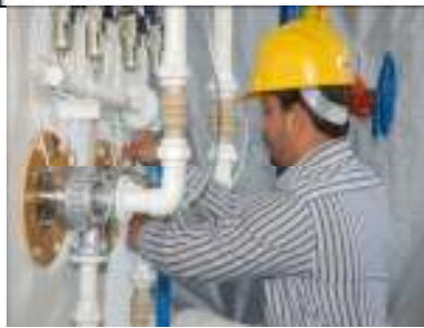
4. TURBO EXPANDER