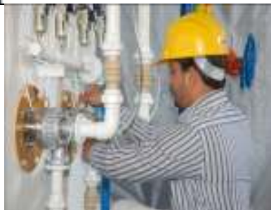
4. TURBO EXPANDER