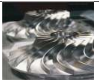
TURBINE VANES- LONG LIFE-FASTEST COOLING