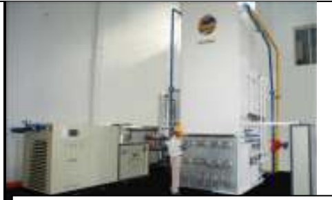
UBT TURBO OXYGEN PLANT INSIDE FACTORY