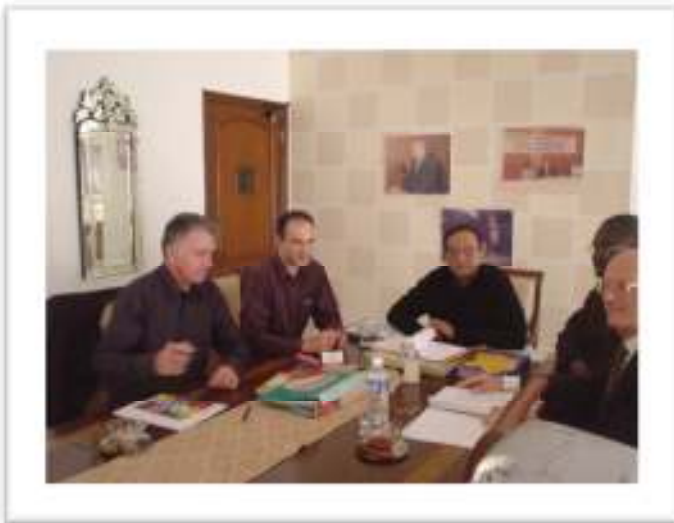
AIR LIQUIDE FRANCE ENGINEERS AT OUR NEW DELHI OFFICE